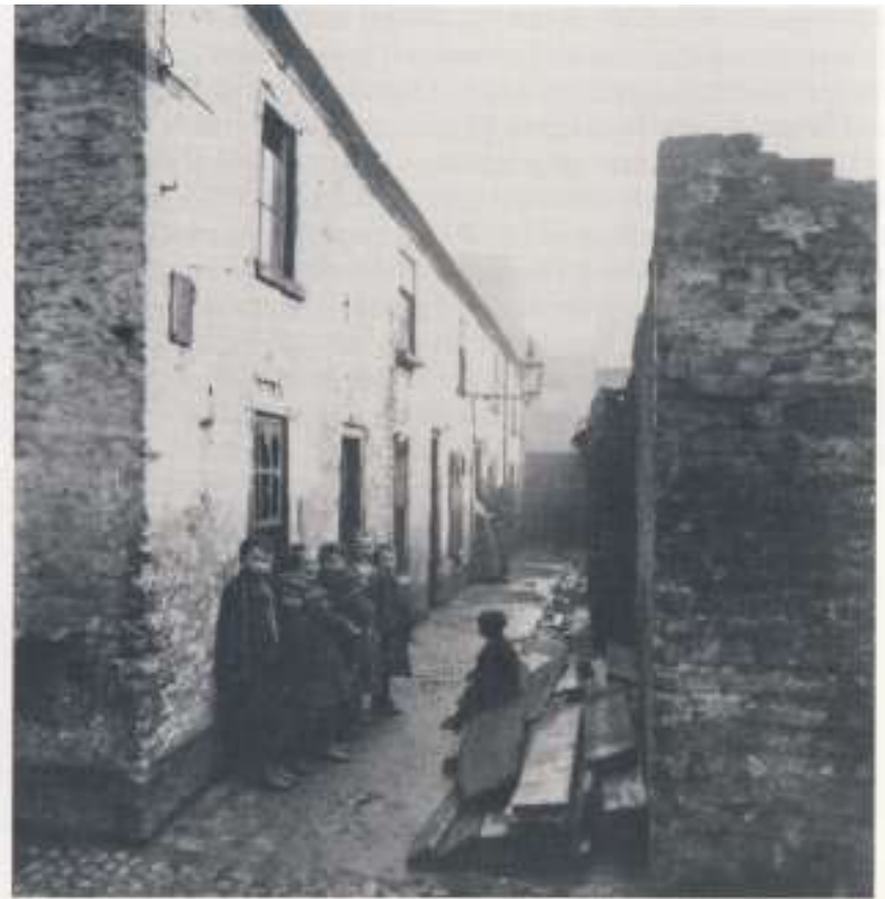
Fig. 6. Mitchell's Court (off Brown Square), terrace of four cramped run-down houses facing to a narrow entry, photographed in March 1912. Women in the doorway look down at eight small children, all reasonably clad.