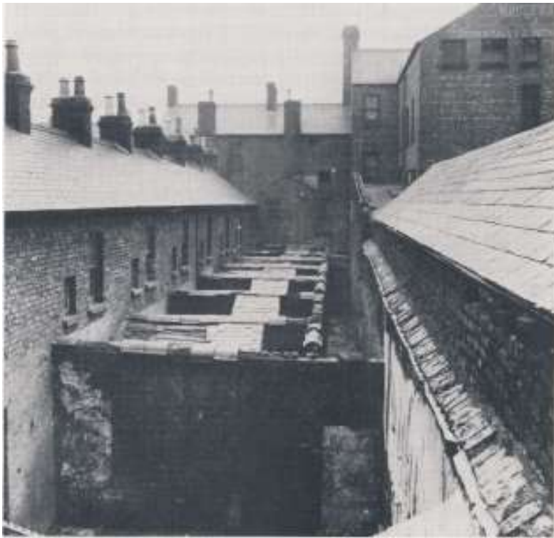
Fig. 5. Rear view of houses in Smithfield. A requirement of housing bye-law was for each house to have a yard at least ten feet square with a separate privy (dry closet). A privy roof can be seen in each yard, also the common entry at the back used for emptying refuse from the houses and conveying the contents of the earth privies and ashpits to the outside street.